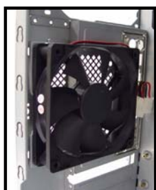
12CM Rear Fan