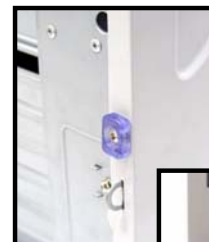
Screw-Less Door Locks & Pad Lock Design